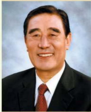
Kim, Yung Hoon Mayor of Jeju City, Korea

Jeju City is the biggest island of the Republic of Korea and it is located in the northern coast of Jeju Island, located in the farthest south. In addition, as the major gateway city of Jeju Island, it is the major city of culture, tour, and education of population of 300,000 on the basis of infrastructure such as Jeju International Airport and Jeju Port.